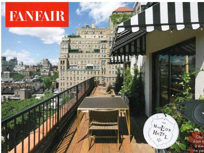
Clockwise from top left: a view from the penthouse terrace; a hotel key fob; a penthouse suite, the lobby.