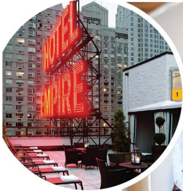
1 The Upper West Side's Empire Hotel, which houses Ed's Chowder House, is across from the shows at Lincoln Center. 2 Bar Boulud's croque madame with fried egg. 3 The Britannia-themed Electric Room bar in Chelsea's Dream Downtown hotel. 4 Dream Downtown's terrace bar, where designers Gurung and Marc Jacobs have been spotted.